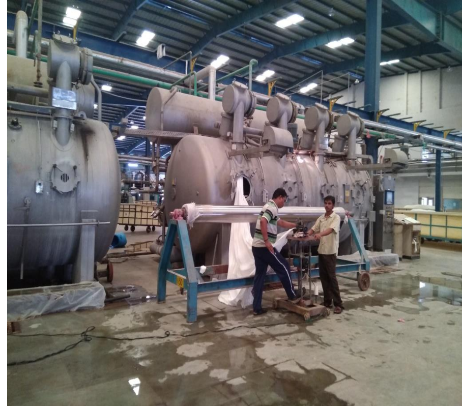
Photographs dated May'2017