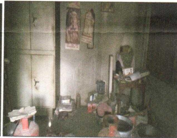
ROOM INNER SIDE VIEW