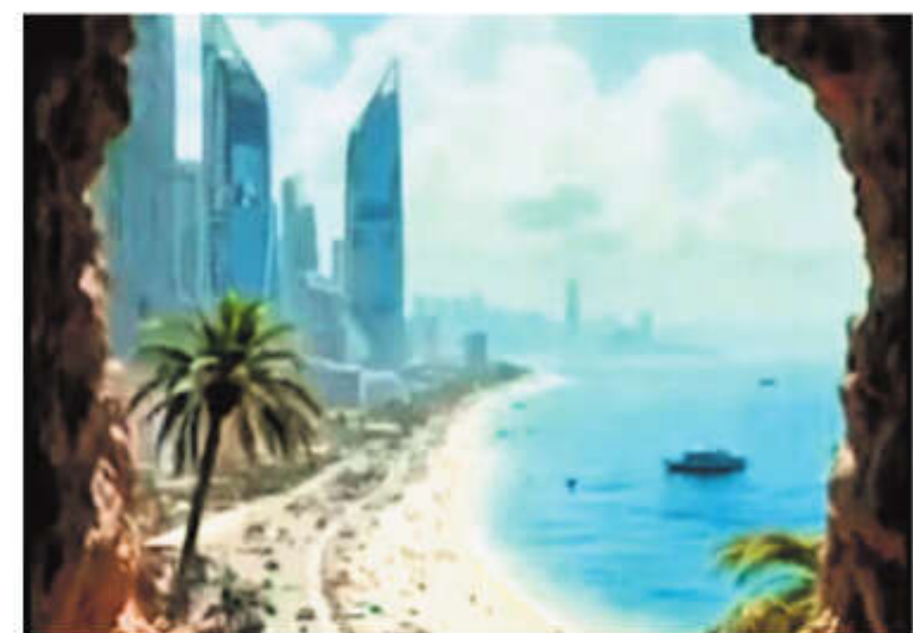
Video posted online by Donald Trump shows skyscrapers along a beach