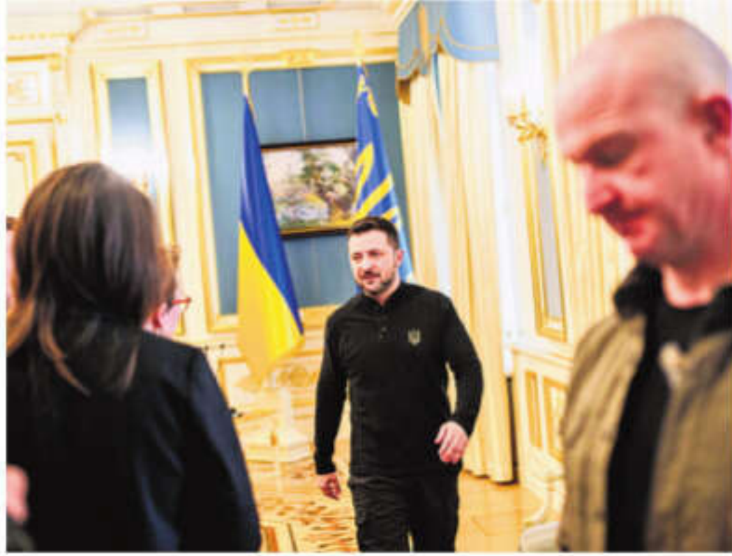
Ukrainian President Volodymyr Zelenskyy speaks to journalists during press conference in Kyiv on Wednesday