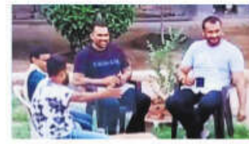
The actor smoking with a coffee mug in hand in Bengaluru prison

NINE police officers, including the chief superintendent of Bengaluru Central Prison at Parappana Agrahara, have been suspended after a video and photograph of actor Darshan Thoogudeepa having tea and cigarette with other pris-