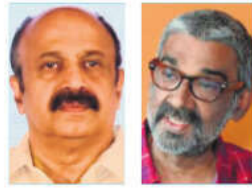
Actor Siddique(L) and Director Ranjith

Meanwhile, the Kochi city police registered a case against Ranjith after a Bengali actor filed a sexual harassment complaint against the filmmaker. Ranjith had resigned as the chairman of the Kerala Chalachitra Academy following the allegations. Rocking the film fraternity further, senior actor Geetha Vijayan, actor Minu Muneer and a junior artist went public on Monday to narrate the traumatic experiences they encountered from some of