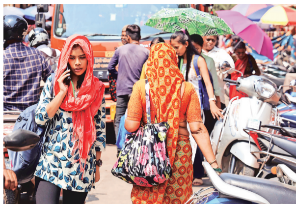
BEATING THE HEAT: People protect themselves from heat in Thane on Thursday.

"The committee shall suggest short-term and long-term measures in report so as to ensure that such incidents do not take place in the future," the bench noted in its order. The court directed the panel to complete the exercise within two months and sought its report on or before June 16, the date of next hearing.