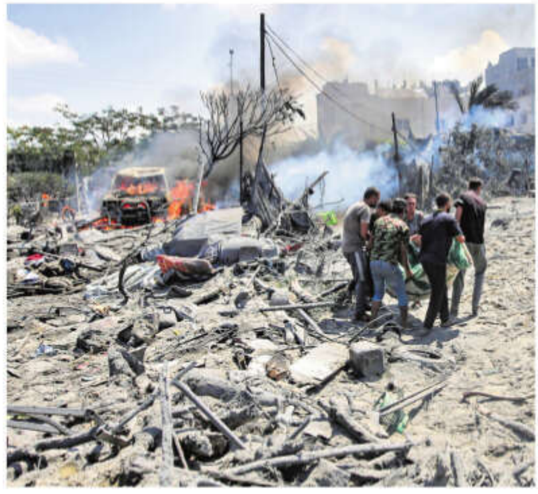
Palestinians carry a body from a site hit in an Israeli attack in Khan Younis