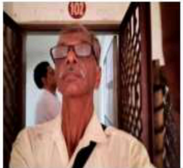
Site Inspection Proof