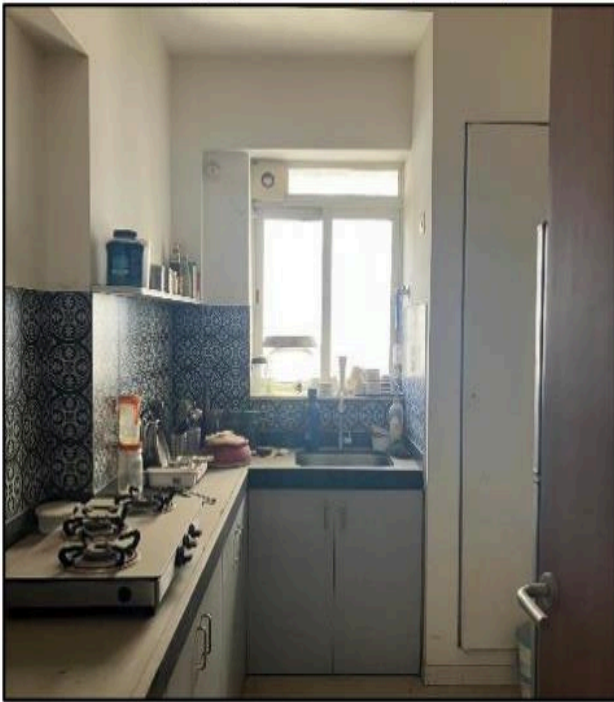
Internal View of Kitchen