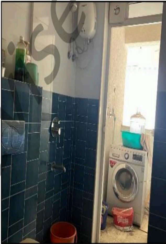
Internal View of Bath + WC