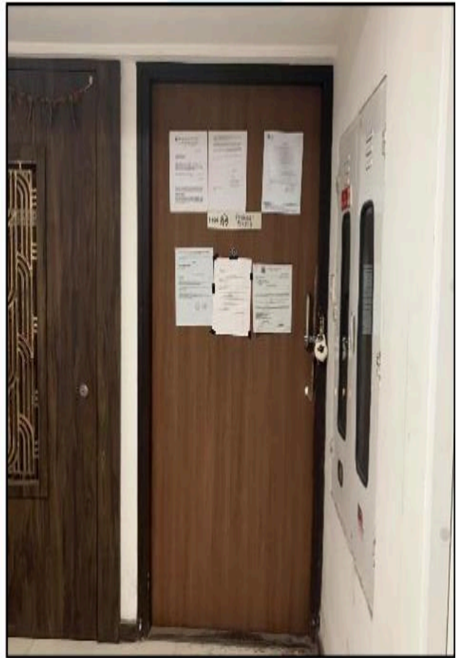
View of Entrance Door