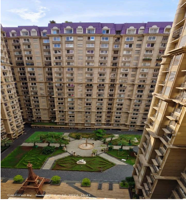
Captured By...Swapnil Jun 12, 2024, 16:21