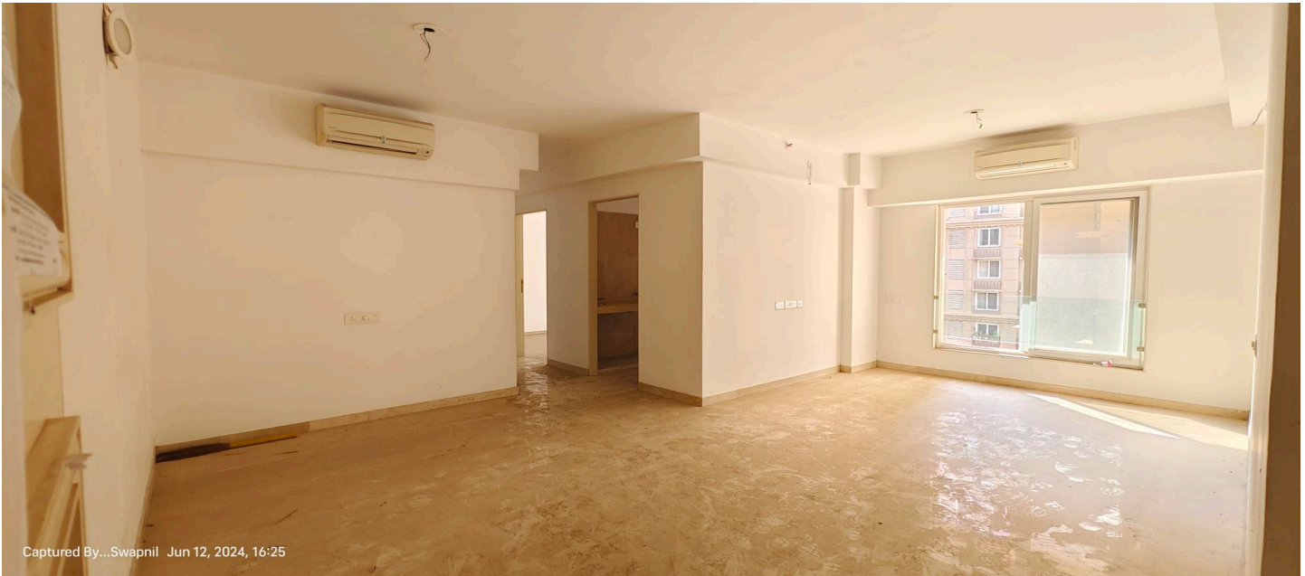
Jun 12, 2024, 16:25