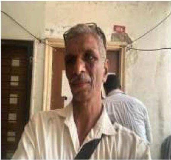
Site Inspection Proof